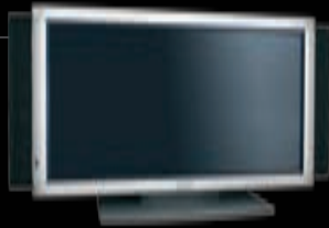
P55 XTS 51ES

The Plasmavision™ P55 XTS 51ES is part of Fujitsu's latest line of high definition Plasmavision™ monitors, bringing the ultimate viewing experience into your living-room.